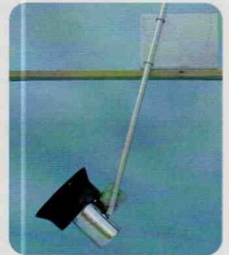
Dock Mounting Kit